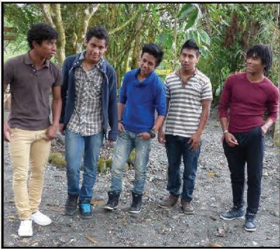
With these upgraded facilities, we can offer Casa Gabriel's former street boys a better opportunity to successfully pursue their dreams.

To give to this project go to: www.iteams.org/give on behalf of "Casa Gabriel Home Renovation, Phase Two"