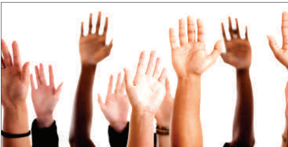
Serving As a Sacrifice of One's Time