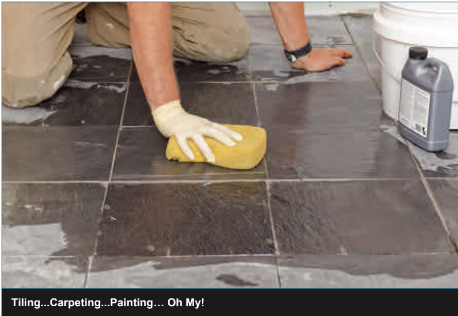
Tiling...Carpeting...Painting... Oh My!