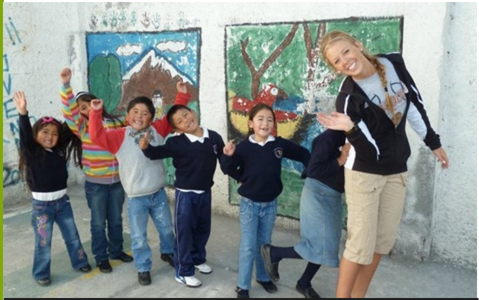
A heart for culture