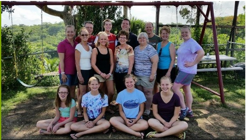
Team Robin's Nest 2015

No Worship Service on Saturday, July 4th! Happy Independence Day!