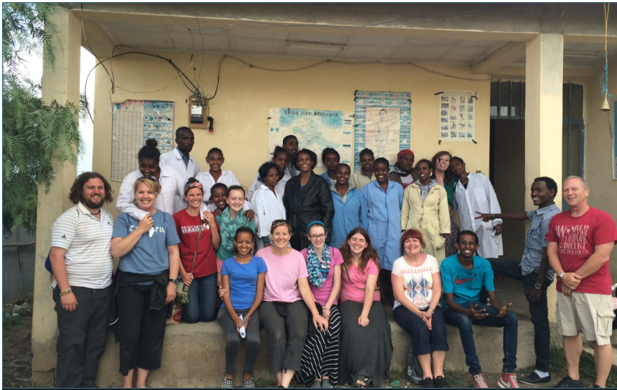
Cheers from Ethiopia!

them. We have played together, laughed together, and shed tears together. And together, we trust in the Holy One; the King of Kings!